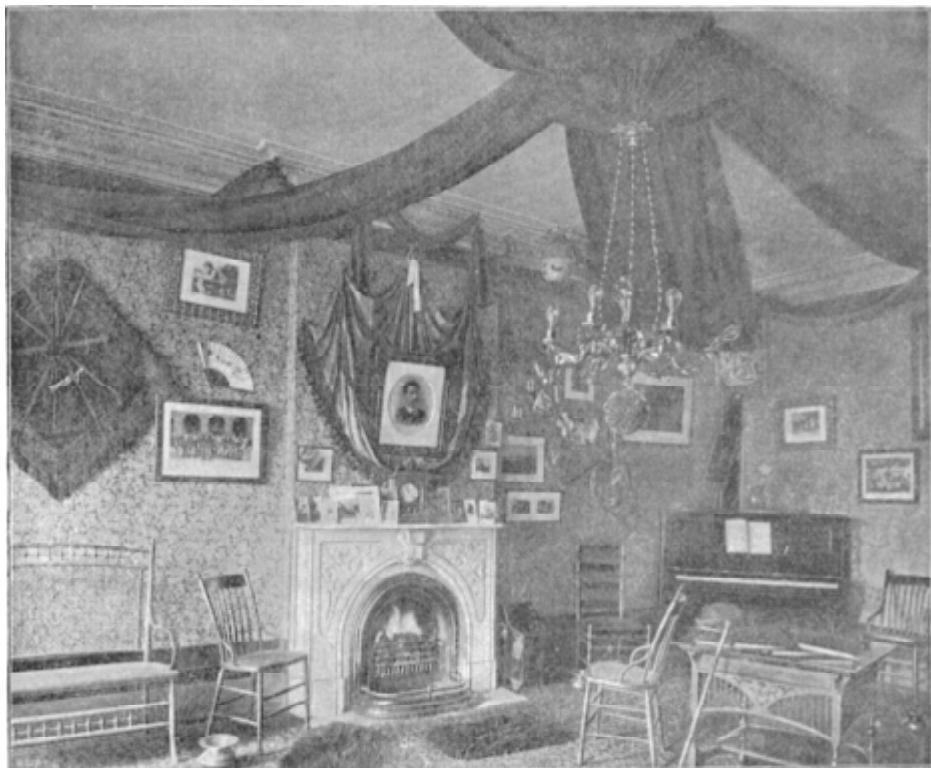
A COSY CORNER IN THE CLUB HOUSE.