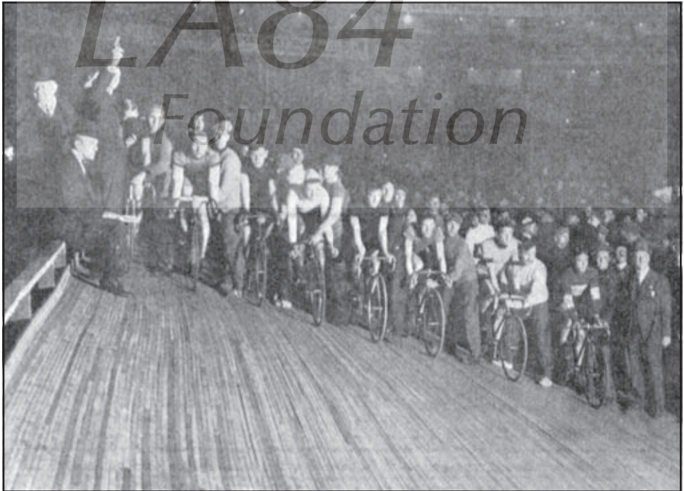
Start of the Six-Day Bike Race at Madison Square Garden, New York, December 6, 1913