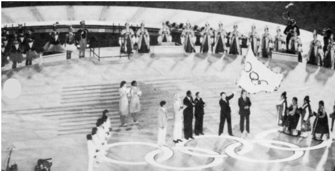
The olympic flag is handed over to the Mayor of Seoul

To all the Olympians who have participated here. Please accept our gratitude and heartfelt thanks. At the Opening Ceremony we said that you were the finest group of athletes ever assembled and you proved that to be true before the eyes of the world.