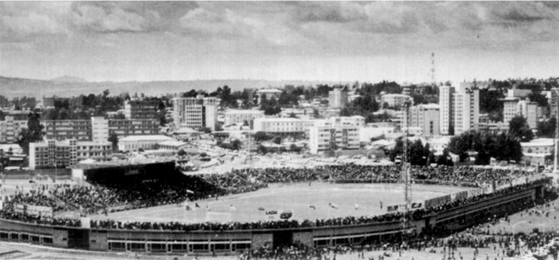
The stadium in Addis Ababa during the 10th African Nations Cup.