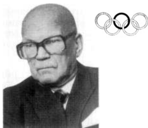
President Urho Kekkonen