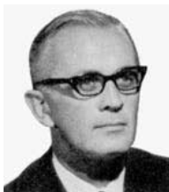
Dr. Alejandro Giammattei Caceres, President

● In a previous edition we mentioned that Dr. Alejandro Giammattei Caceres had become President of the Guatemala NOC. Having graduated as a dental surgeon from the faculty of dentistry of the University of San Carlos in Guatemala, he was a member of the national basketball team in 1958. He became Vice President of the National Bowls Federation from 1964 to 1966, and in 1970 President of the Guatemala Autonomous Sports Confederation—the country's highest sports authority—until 1973. Meanwhile in 1972 he was elected Vice-President of the Organising Committee of the first Central American Games. In December 1973 he was elected President of the Guatemala NOC. An enthusiastic athlete, he practised many sports (basketball, volleyball, table-tennis, etc.) and is still an active softball player.